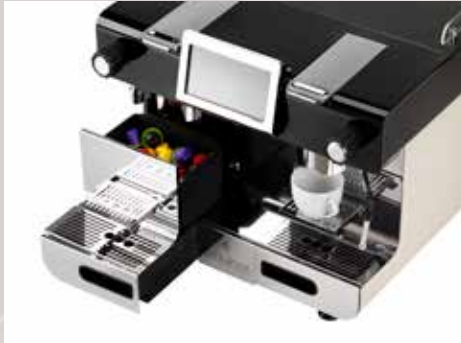
Drip tray with separate capsule container