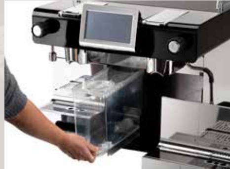
Water Tank, front loader*

* Main water connection optionally available