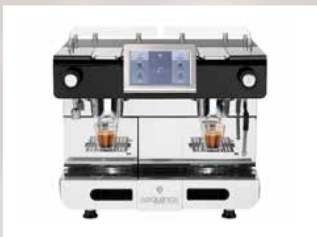
Double outlet to indicate HoReCa style coffee serving