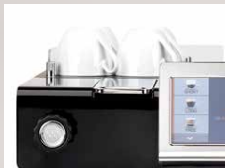
Cup warmer for 25 espresso cups