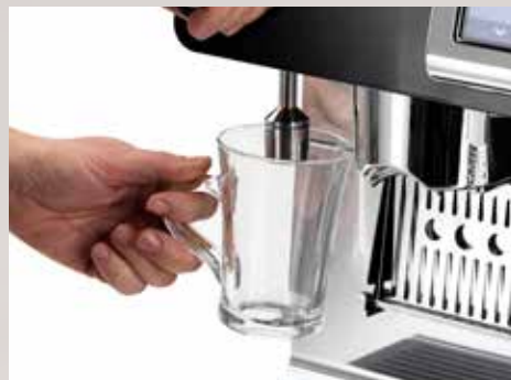
Steaming hot water