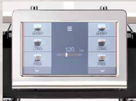
7 inch touch screen with easy to use programmable menu