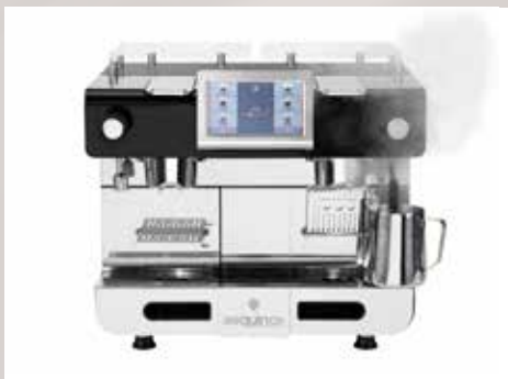
Steam wand; professional dry high pressure steam