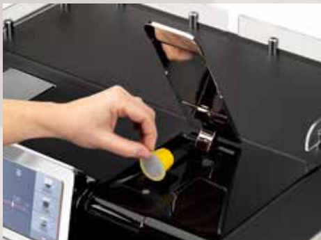
Top levers in stainless steel

* Main water connection optionally available